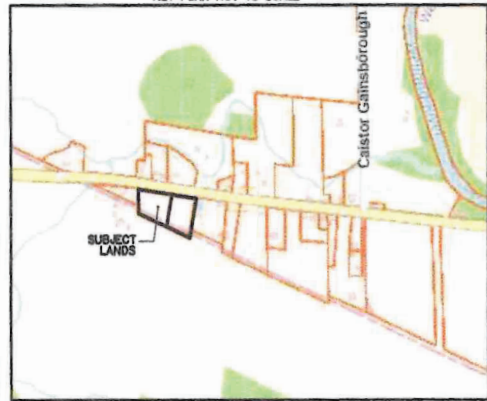
KEY PLAN NOT TO SCALE

SCALE 1 : 500 SURVEY : 25-262 DRWN BY : T. Matheson