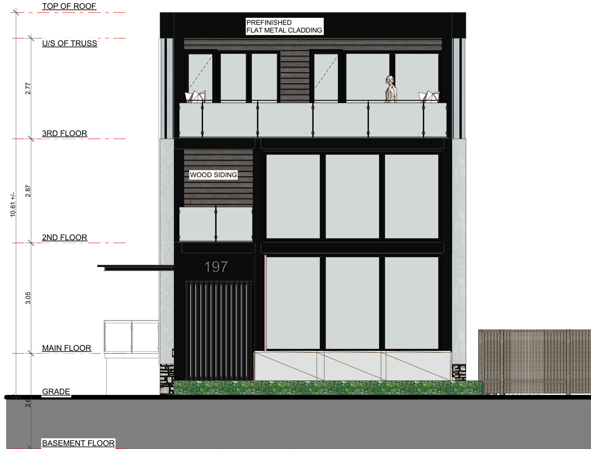
1 East Elevation SCALE: 3/16" = 1'-0"