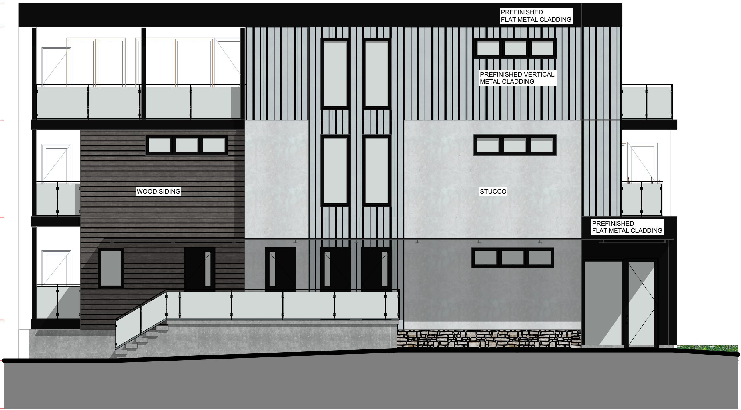
1 South Elevation SCALE: 3/16" = 1'-0"

TOP OF ROOF U/S OF TRUSS 2.77 3RD FLOOR 10.61 +/- 2.87 2ND FLOOR 3.05 MAIN FLOOR GRADE 2.63 BASEMENT FLOOR