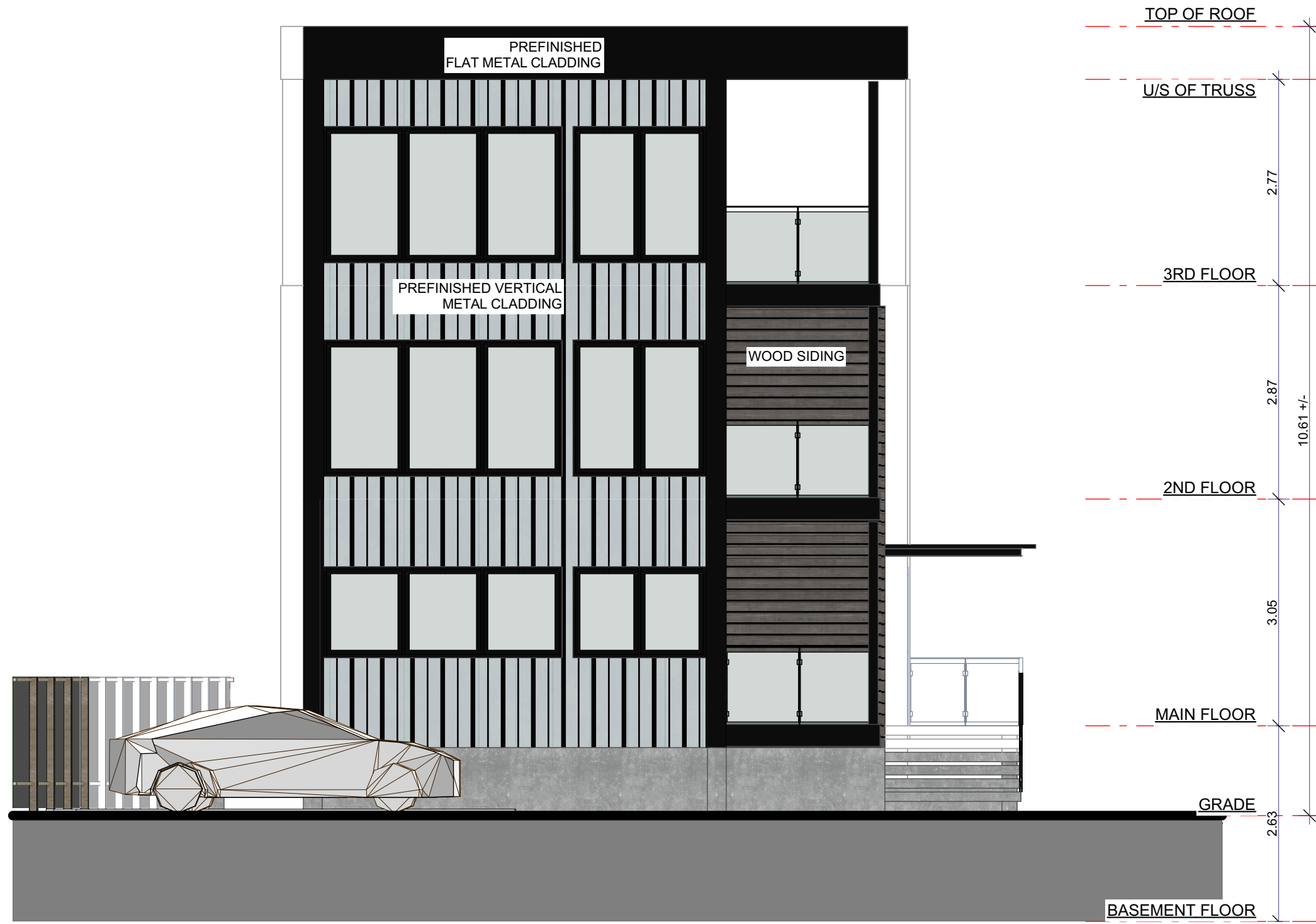
1 West Elevation SCALE: 3/16" = 1'-0"